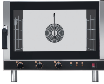
EKFA464ALUD | ITEM: 43323