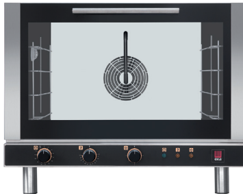
EKFA464UD | ITEM: 43325