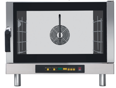
EKFA464DALUD | ITEM: 41924