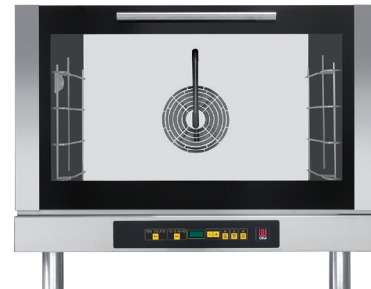
EKFA464DUD | ITEM: 43324